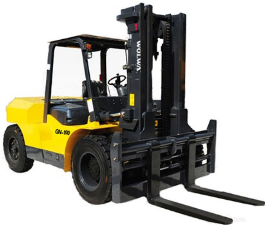
Diesel forklift GN100 product picture