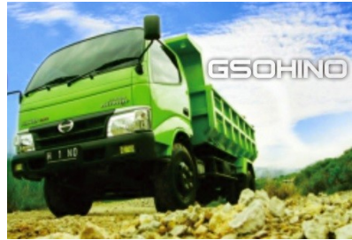
130 HD X Power