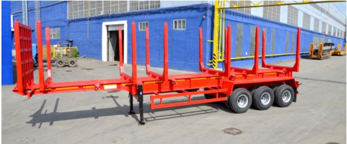
Log / kayu truk transportasi