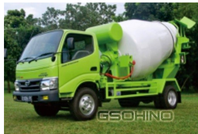
130 HD Mixer