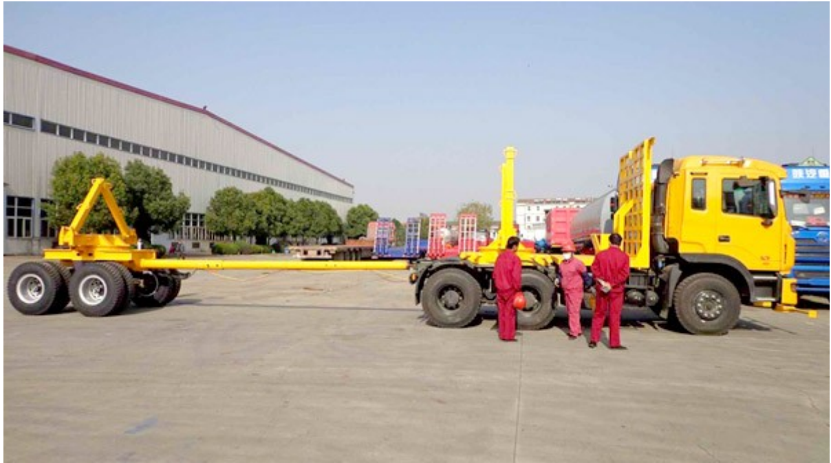
Timer gandengan 3 as roda