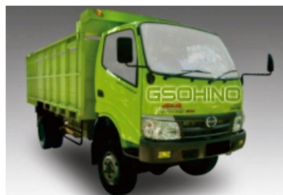
130 HD 4 x 4